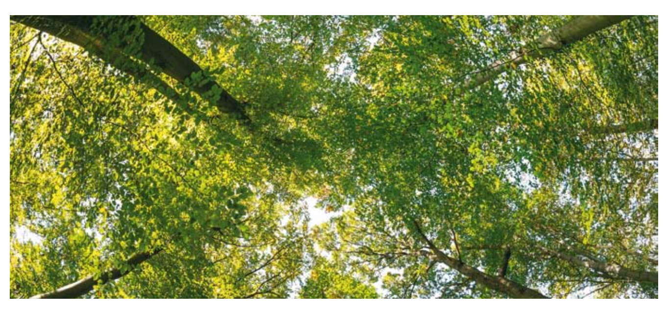
A major recent deal reflected the economic potential of bio-based production. By 2019, Chinese firm Sunshine Kaidi New Energy Group will have invested €1bn in a new wood-based biodiesel plant in Finland, creating 4,000 new jobs along the way.

Coca Cola bottles by 75%," one whistleblower who wished to remain anonymous told us. "That's much more than waste prevention, which is the current focus of the Commission's package." And it's true that the EC's legal proposals don't mention the bioeconomy a single time. Neither does its 2016/17 working plan, which lays the foundation for future funding calls. Instead, the legal package aims to: